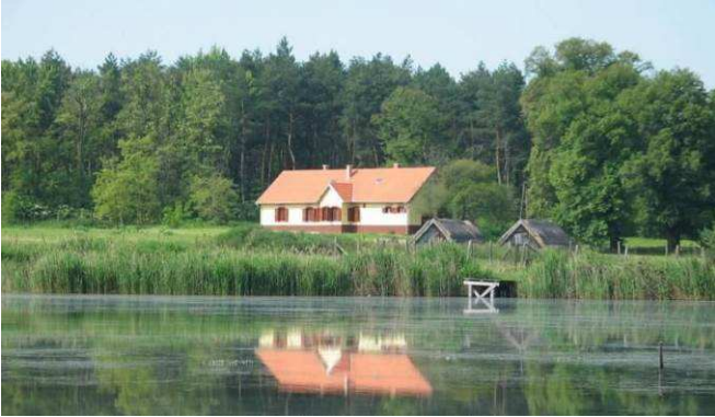
Hunting lodge Sarosfő