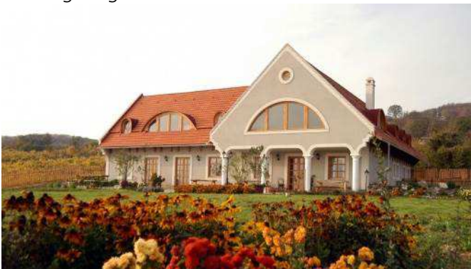
Hunting lodge Weinkeller Koczor Pince