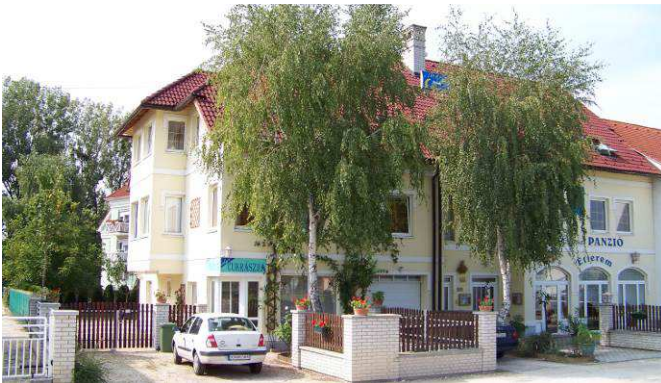
Guest house Czuczai