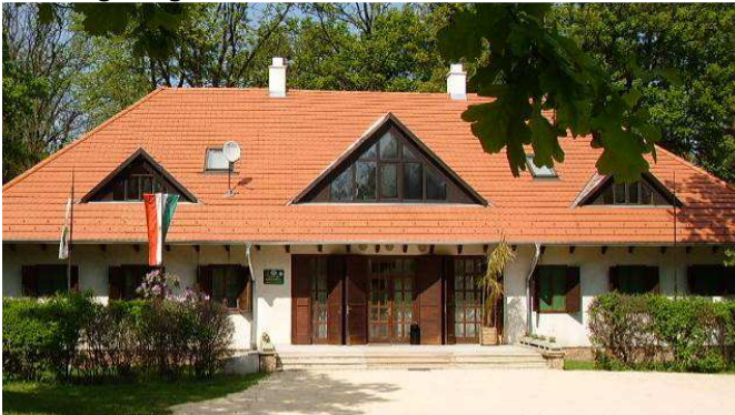
Hunting lodge Hódosér