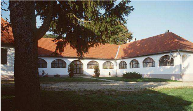
Hunting lodge Huszarokelöpuszta