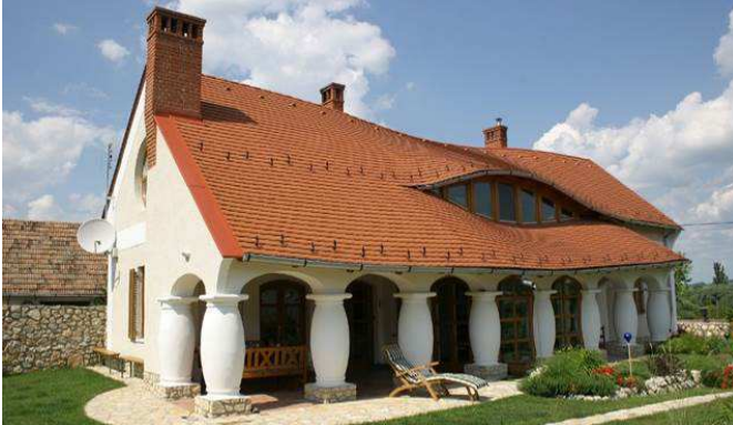
Guest house Hench in Diszel