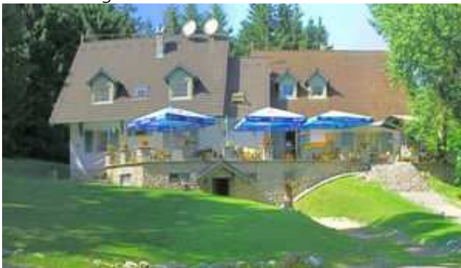
Inn Villa Negra