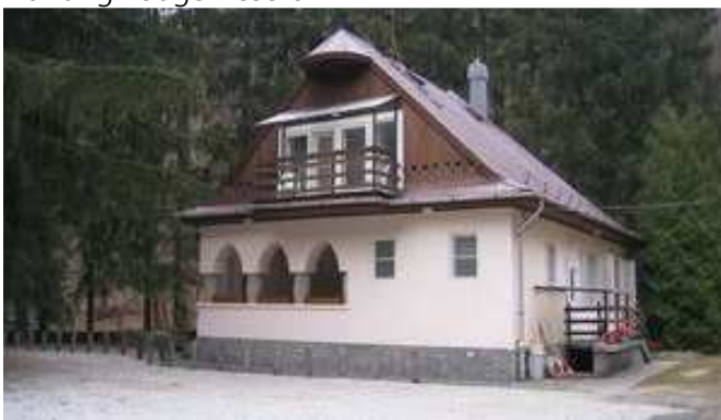
Hunting Lodge Keserü