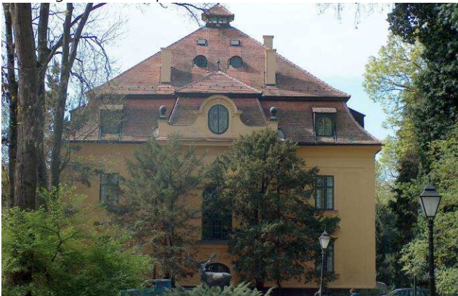
Hunting castle Karapancsa