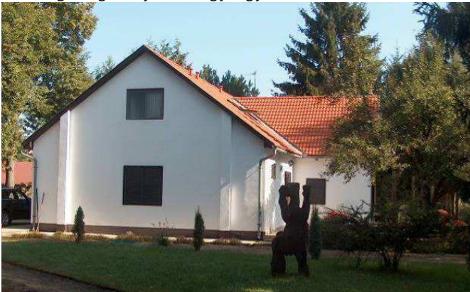
Hunting lodge Hajosszentgyörgy