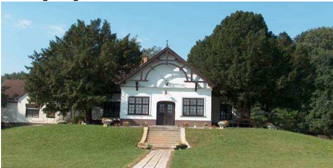
Hunting lodge Gemenc