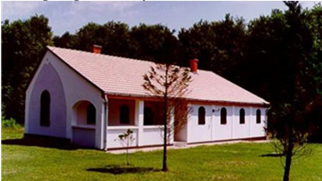
Hunting lodge Vitéztanya