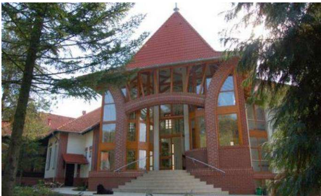
Hotel Kardosfa ***