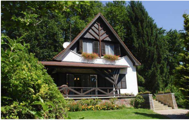
Hunting lodge Vörösalma