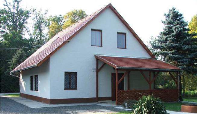
Hunting lodge Csöprönd