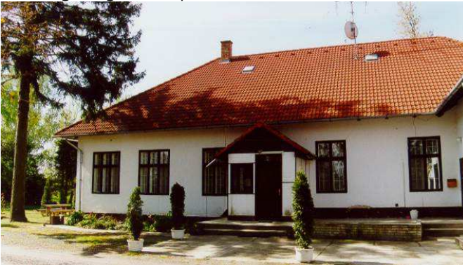
Hunting lodge Zsitfapuszta