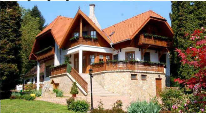
Hunting lodge Agneslak