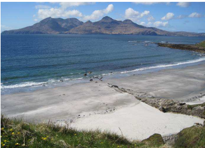
Rum from Muck

There are two Professional Hunters and each one can take out two hunters per day. Observers can accompany the Ghillies and remain out of sight until success has been achieved. Non-hunters can also go fishing in the 6 lochs or two small rivers for brown trout and occasional sea trout.