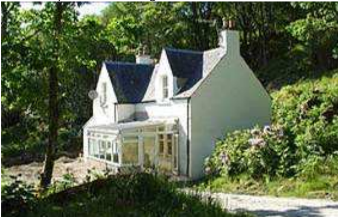
For example Rock Cottage