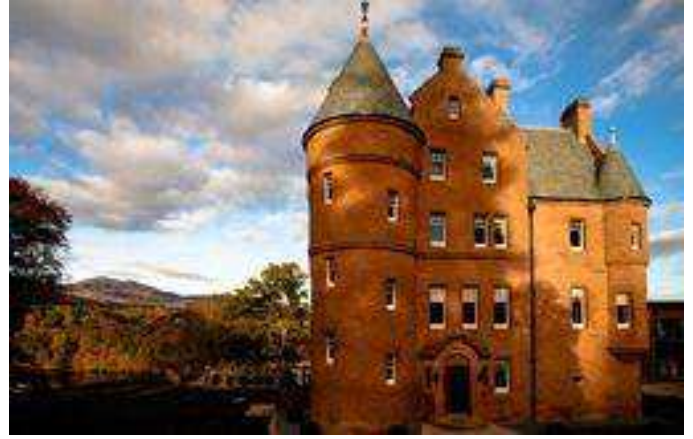
For example Fonab Castle