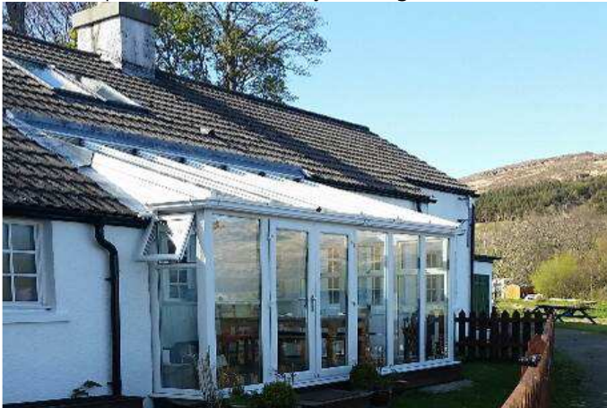
For example Guest House Ivy Cottage