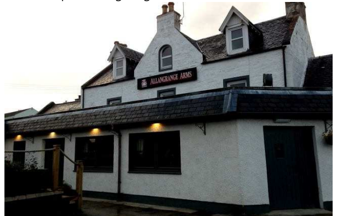
For example Allangrange Arms