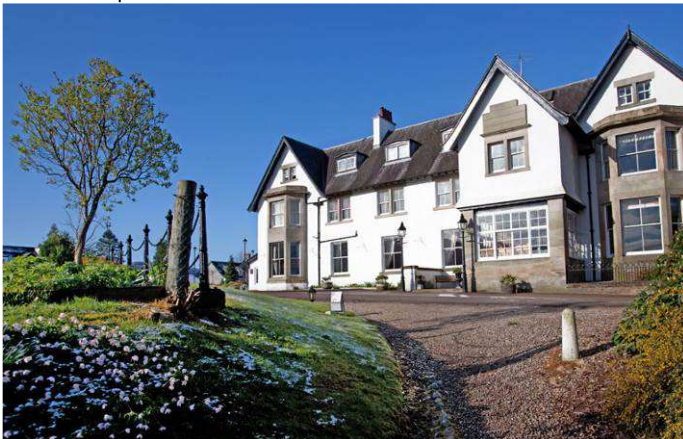
For example The Lovat Loch Ness