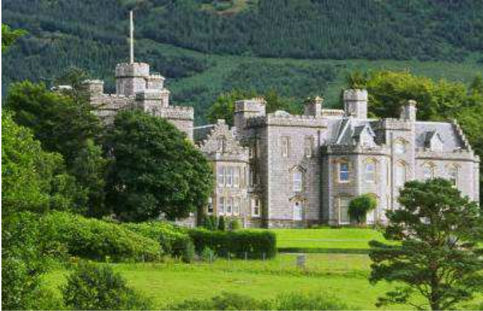
For example Inverlochy Castle