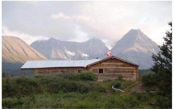
Yukon - Cabin