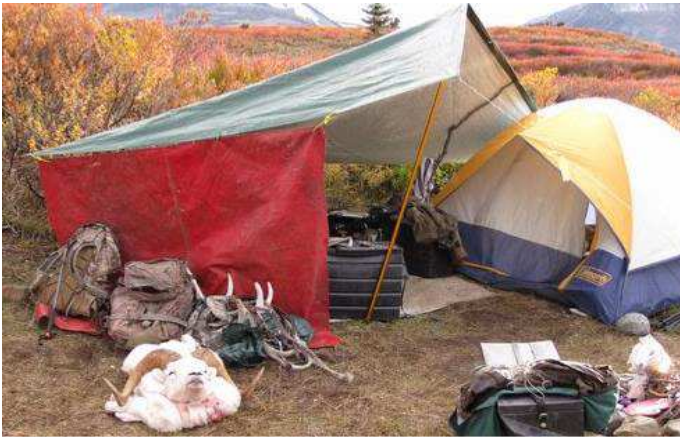
Yukon - Tent