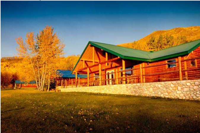
BC - Elisi Spa