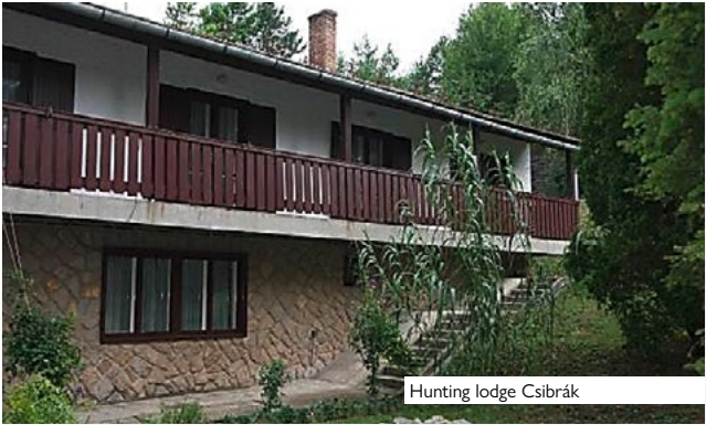
Hunting lodge Csibrák

HUNTING AREA: 7,577 ha NATURAL FEATURES: 65 % woodland ACCOMMODATION: Hunting lodge Obirod, 11 double rooms and 2 apartment