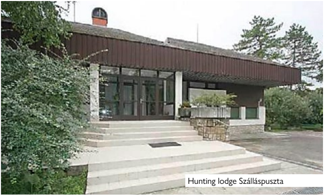
Hunting lodge Szálláspusztá