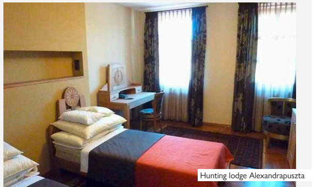
Hunting lodge Alexandrapuszt