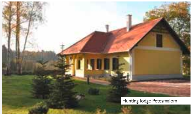
Hunting lodge Petesmalom