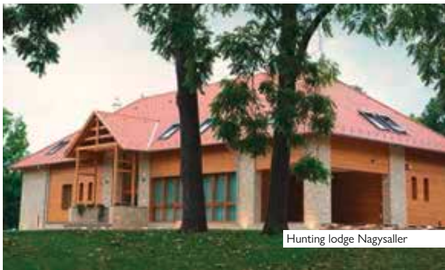
Hunting lodge Nagysaller