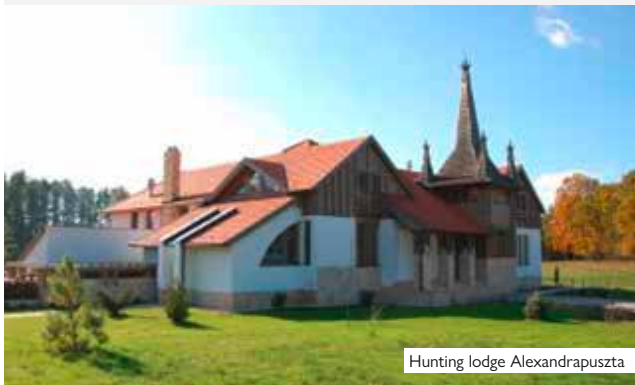
Hunting lodge Alexandrapuszt