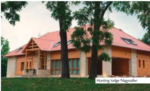
Hunting lodge Nagysaller