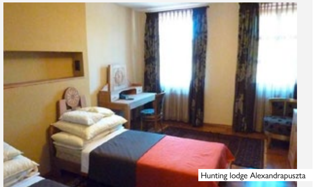
Hunting lodge Alexandrapuszt