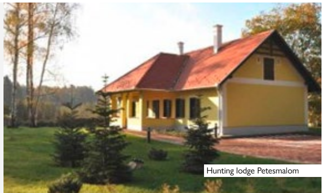
Hunting lodge Petesmalom