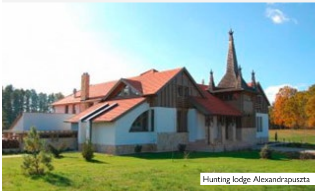
Hunting lodge Alexandrapuszt