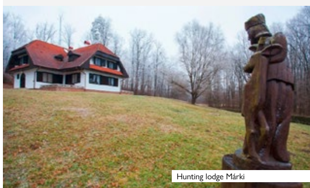
Hunting lodge Márki