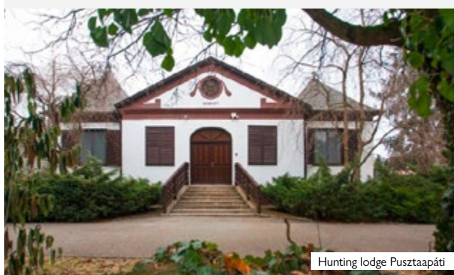
Hunting lodge Pusztaapáti