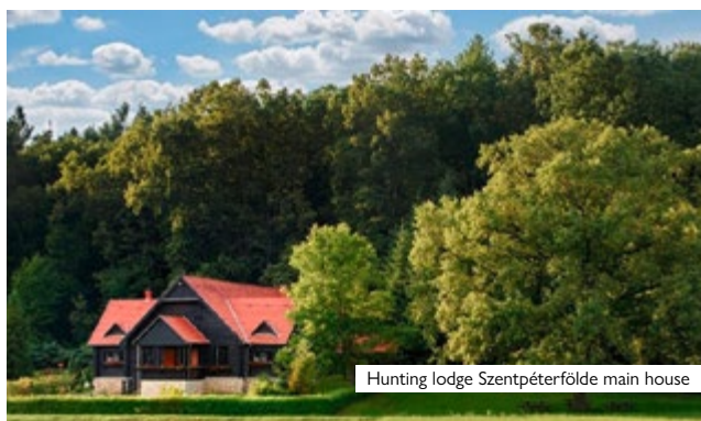
Hunting lodge Szentpéterfölde main house