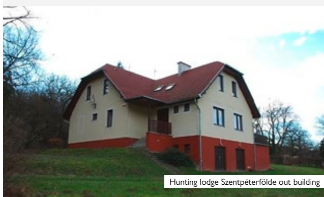
Hunting lodge Szentpéterfölde out building