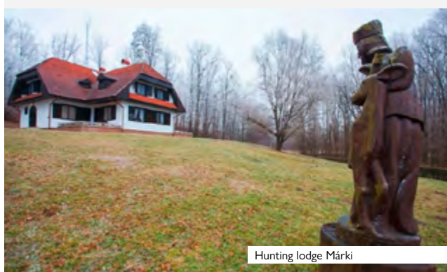
Hunting lodge Márki