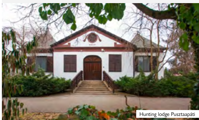
Hunting lodge Pusztaapáti