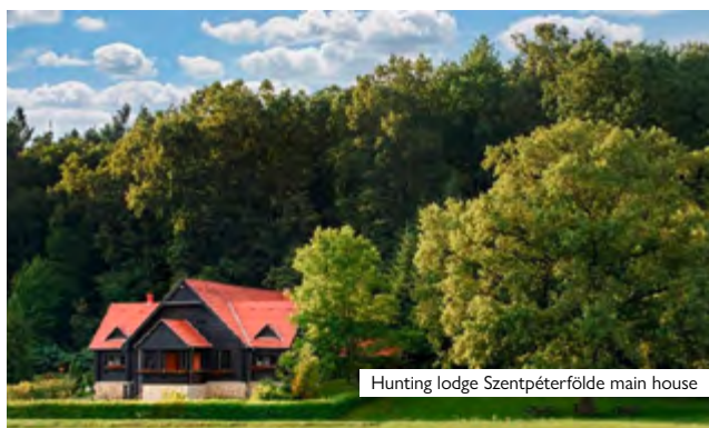
Hunting lodge Szentpéterfölde main house