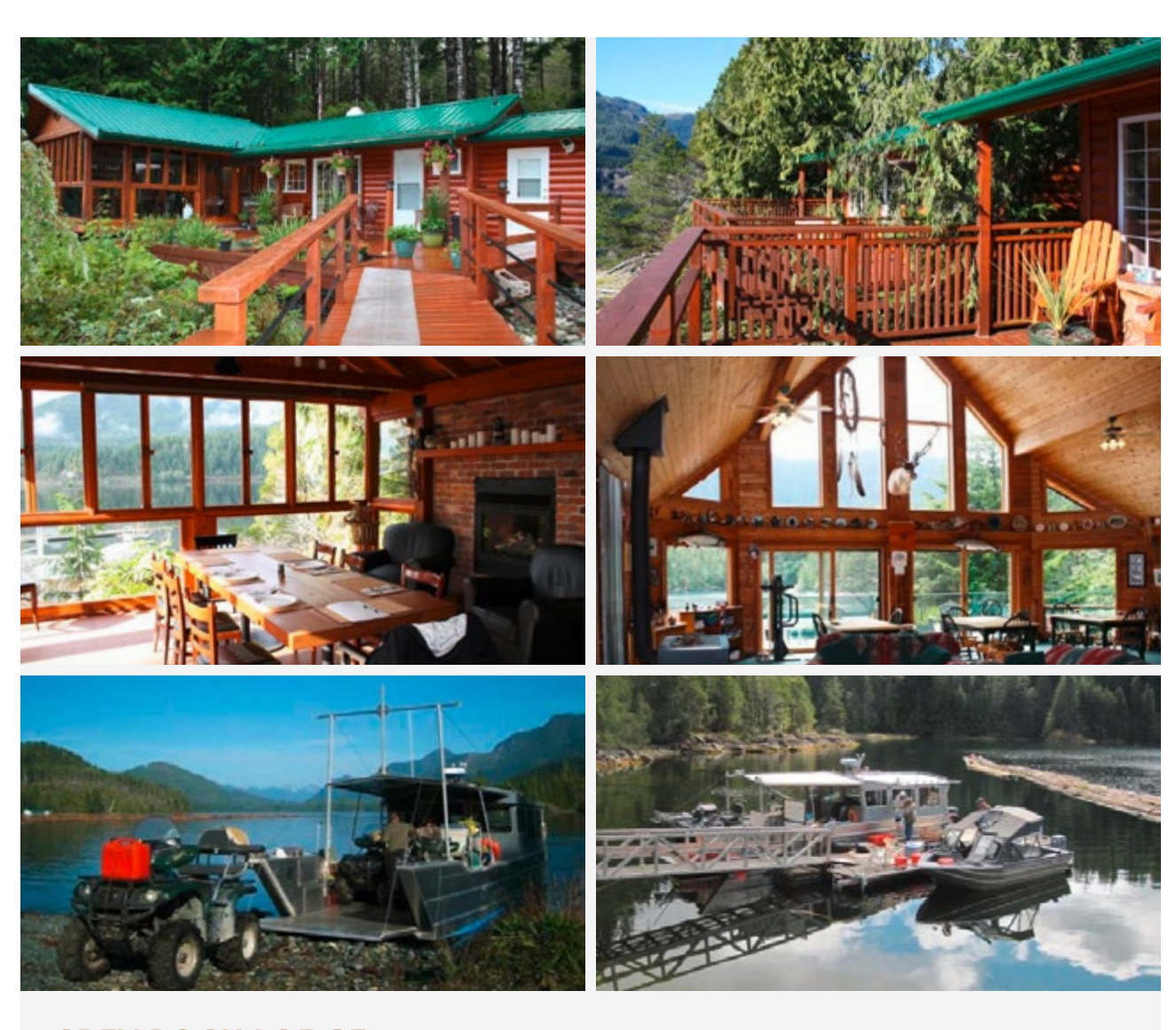
GREY ROCK LODGE