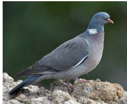
Hunting Season Wood pigeon 01.08.–15.01.