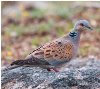
Hunting Season Turtle dove 01.08.–30.09.