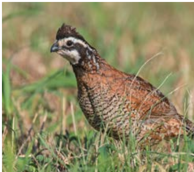
Hunting Season Quail 01.08.–30.09.