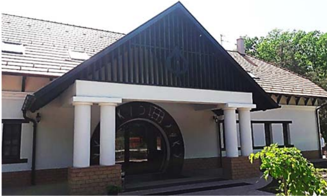
Hunting lodge Karcag-Apavara