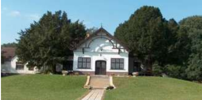
Hunting lodge Gemenc