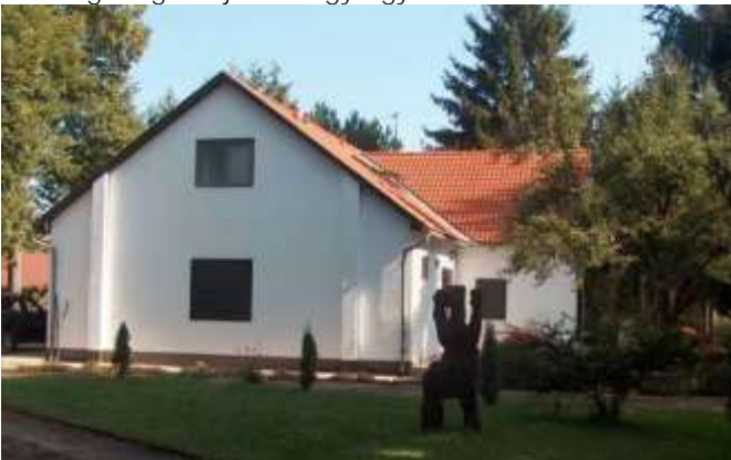
Hunting lodge Hajosszentgyörgy