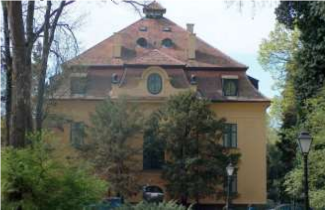
Hunting castle Karapacsa