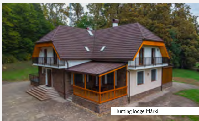
Hunting lodge Márki