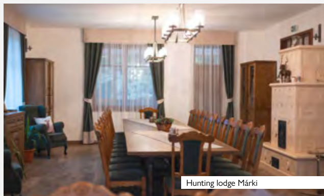
Hunting lodge Márki