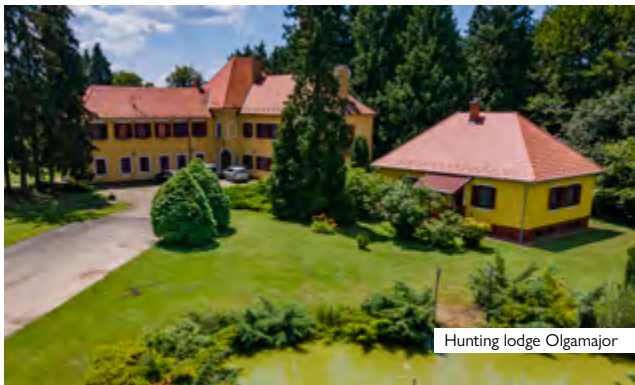
Hunting lodge Olgamajor