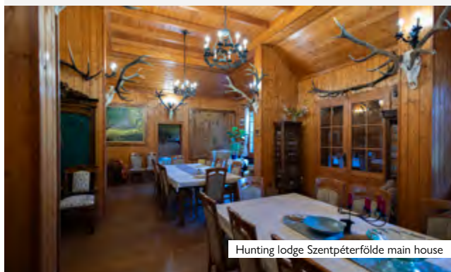
Hunting lodge Szentpéterfölde main house