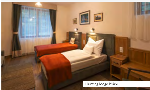
Hunting lodge Márki