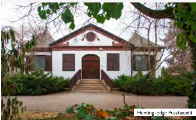
Hunting lodge Pusztaapáti