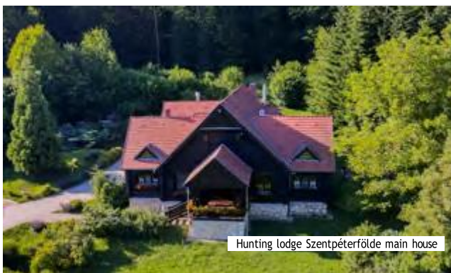
Hunting lodge Szentpéterföldre main house