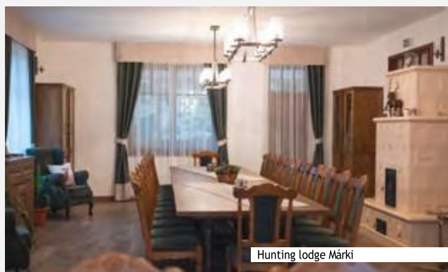
Hunting lodge Márki