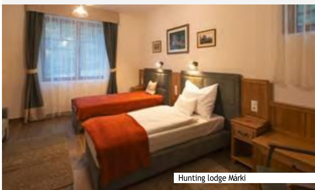
Hunting lodge Márki