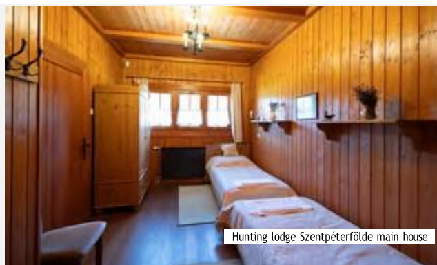
Hunting lodge Szentpéterföldre main house