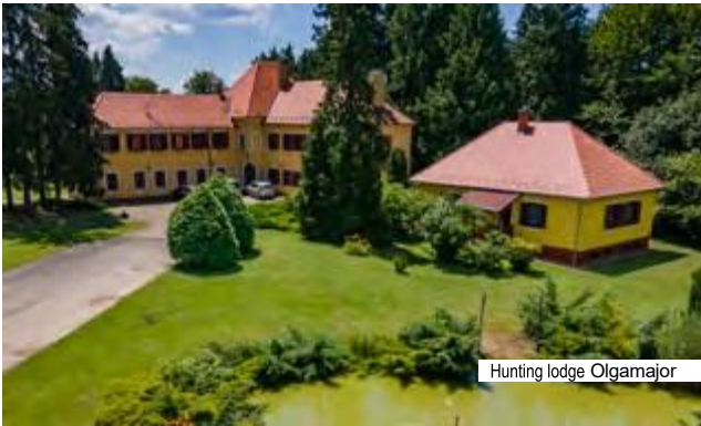
Hunting lodge Olgamajor