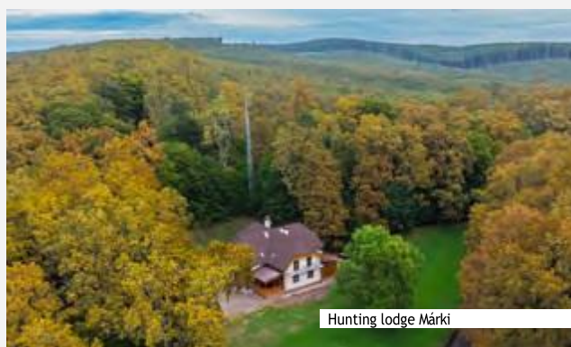
Hunting lodge Márki