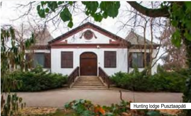
Hunting lodge Pusztaapáti