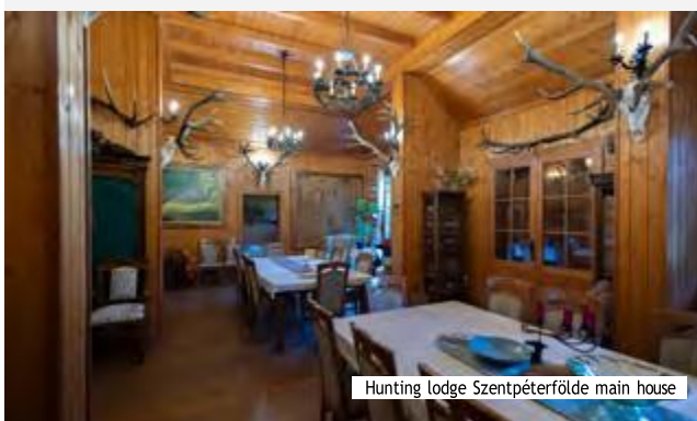
Hunting lodge Szentpéterföldre main house