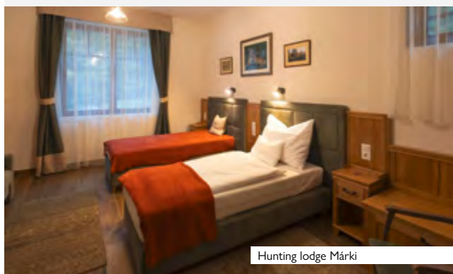
Hunting lodge Márki