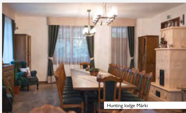
Hunting lodge Márki