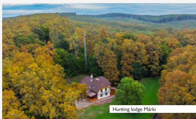
Hunting lodge Márki