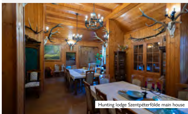
Hunting lodge Szentpéterföldre main house