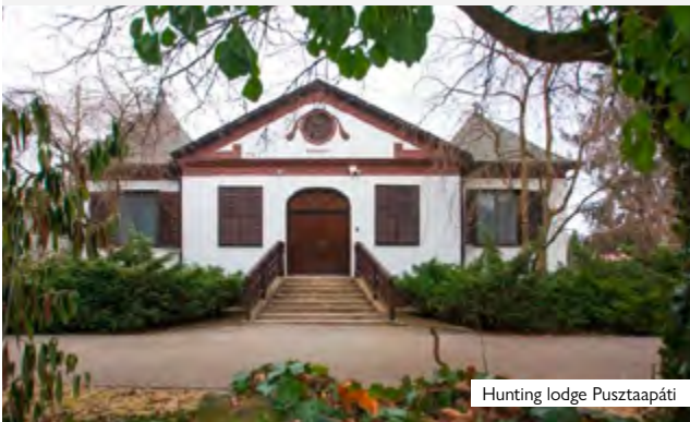
Hunting lodge Pusztaapáti