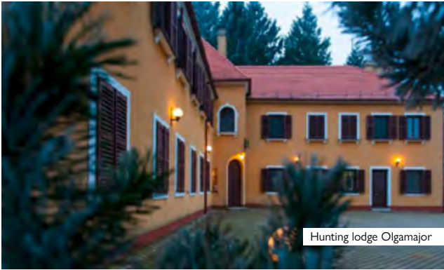
Hunting lodge Olgamajor