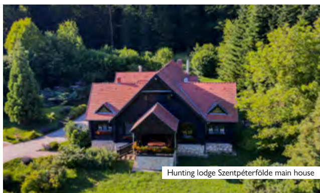
Hunting lodge Szentpéterföldre main house