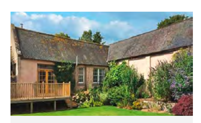
LITTEL FYRISH COTTAGE