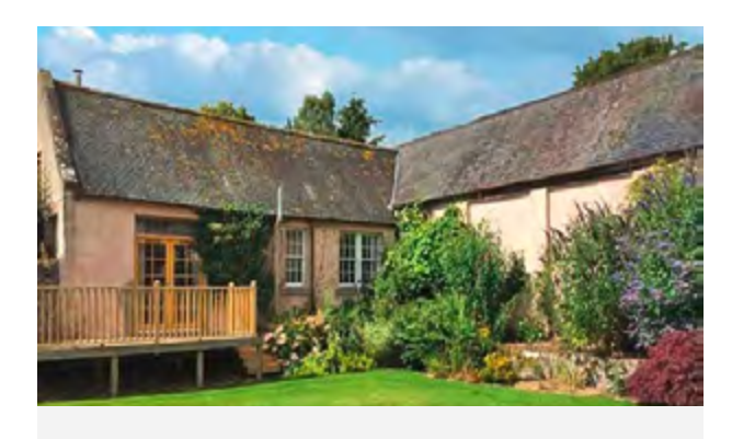
LITTEL FYRISH COTTAGE