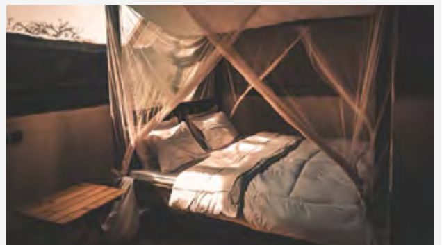
CAMP LAKE NATRON