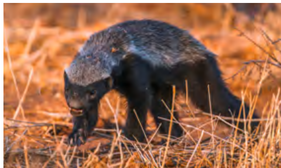
Zambezi Valley (USD)