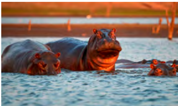
Zambezi Valley (USD)