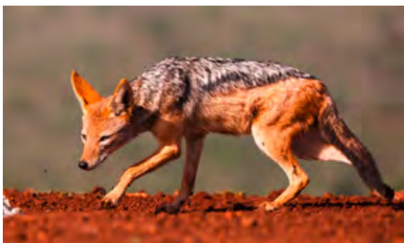
Zambezi Valley (USD)