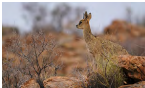
Zambezi Valley (USD)