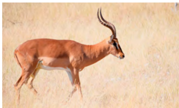
Zambezi Valley (USD)

Male 330,- Female 200,- Female 220,- 330,-