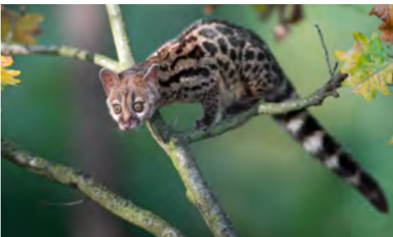
Zambezi Valley (USD)