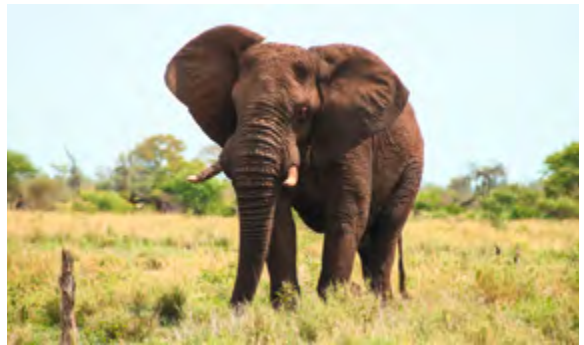
Zambezi Valley (USD)