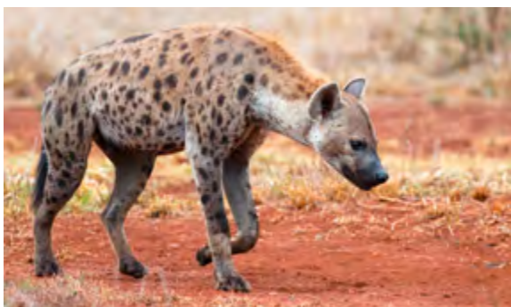
Zambezi Valley (USD)