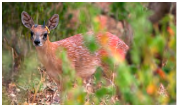
Zambezi Valley (USD)