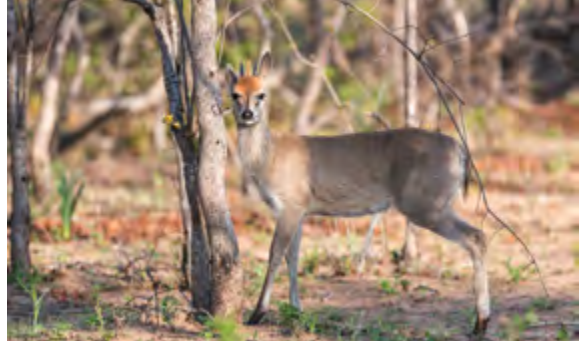
Zambezi Valley (USD)