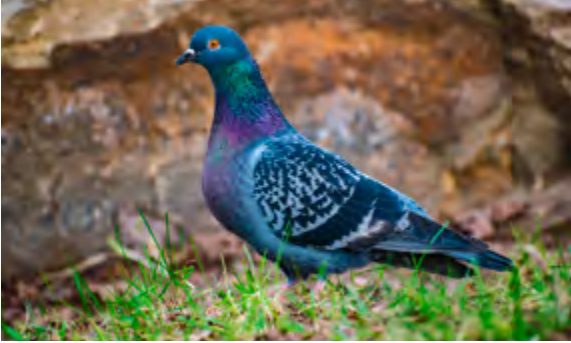
Zambezi Valley (USD)