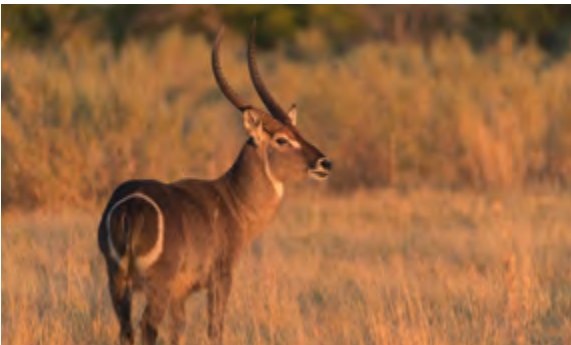
Zambezi Valley (USD)